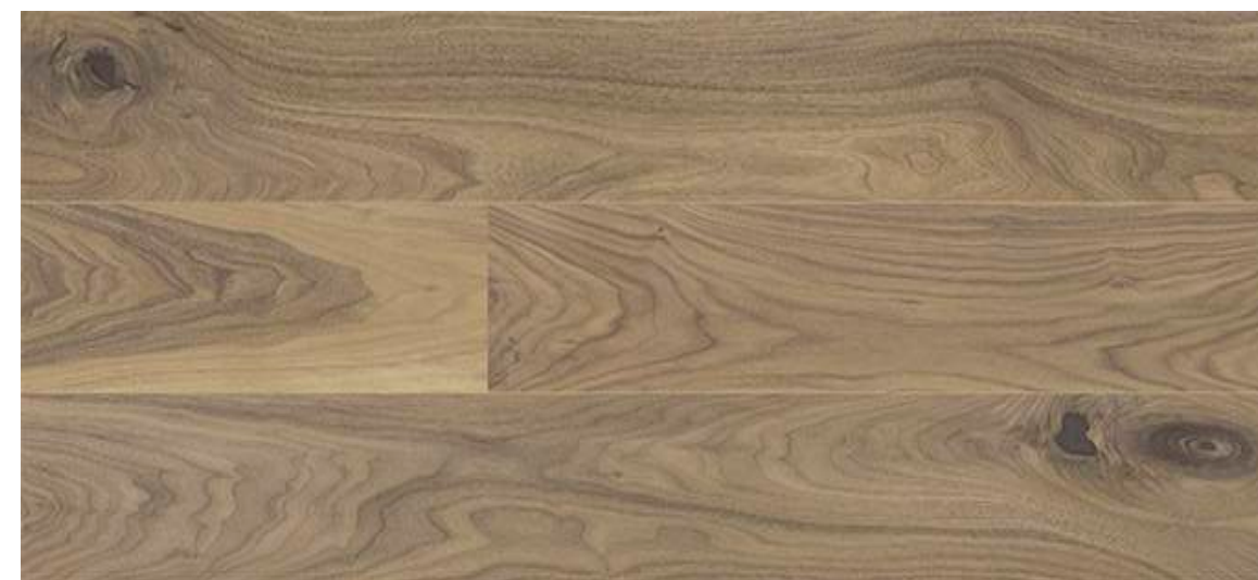
1 Strip US Black Walnut BC 2B Pure Line #5838