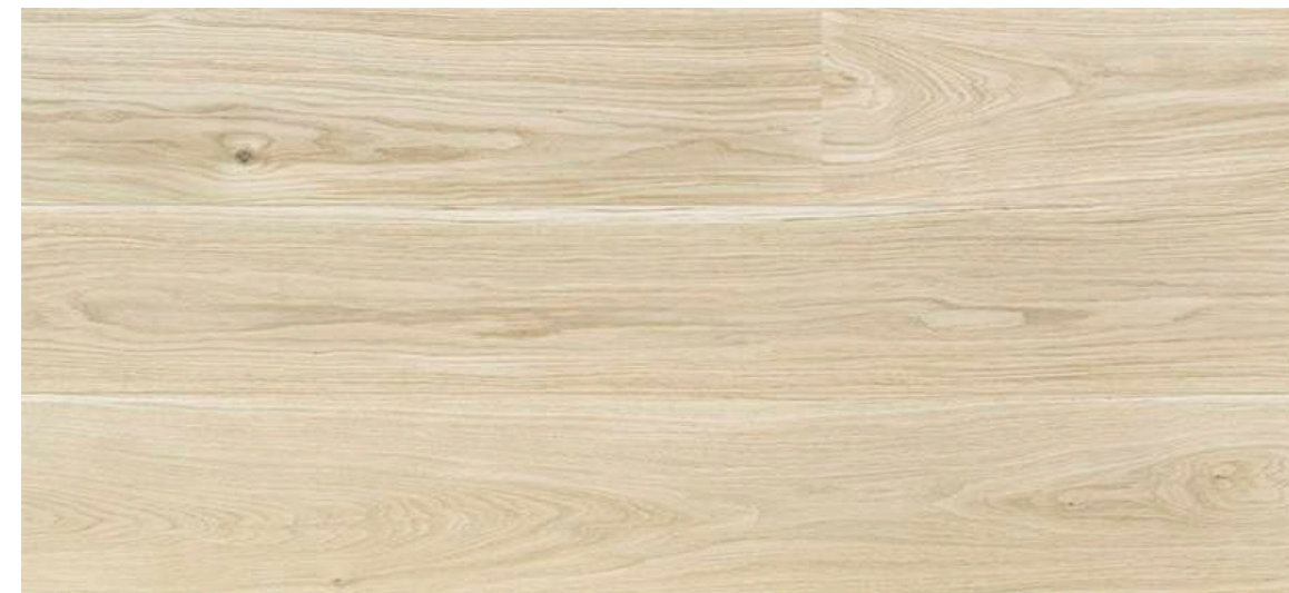
1 Strip 240 mm Wide EU Oak ABC Brush 2B Pure Line #5832

2019 Trend is for pure color and natural surface of the wood. Our new collections represent shades of warm grey and beige colors. The Pure Line Collection brings us color of untreated raw wood in finished parquet flooring. New lacquer surfaces with 5% gloss give the natural oil feeling.