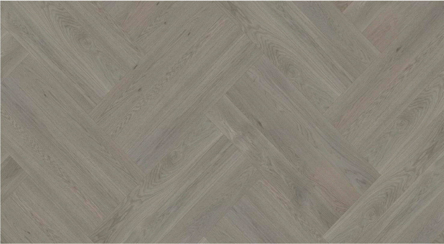
Size Options: 100 x 600 mm 100 x 700 mm 100 x 900 mm 3 lamellas Herringbone Pattern Oak Sandstone Brush 4B