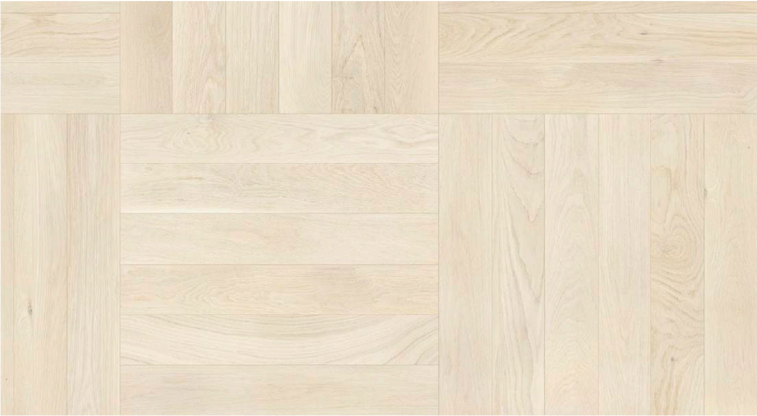
Size Options: 100 x 600 mm 100 x 700 mm 100 x 900 mm Square Pattern Oak London 4B