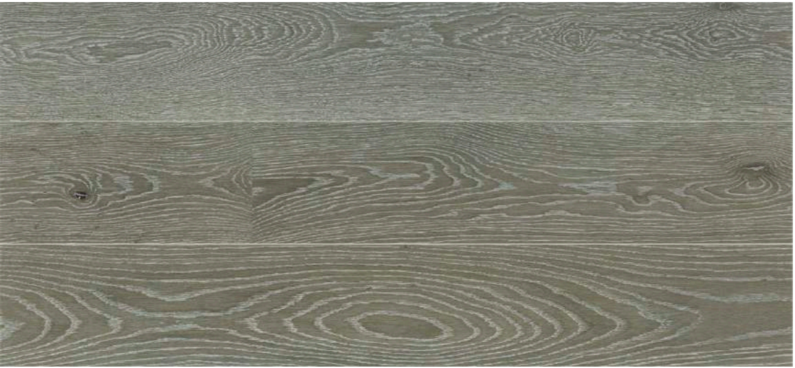
1 Strip Oak AB Olive Grey Ivory Pores 2B Extra Matt Lac Gloss 5% #4061