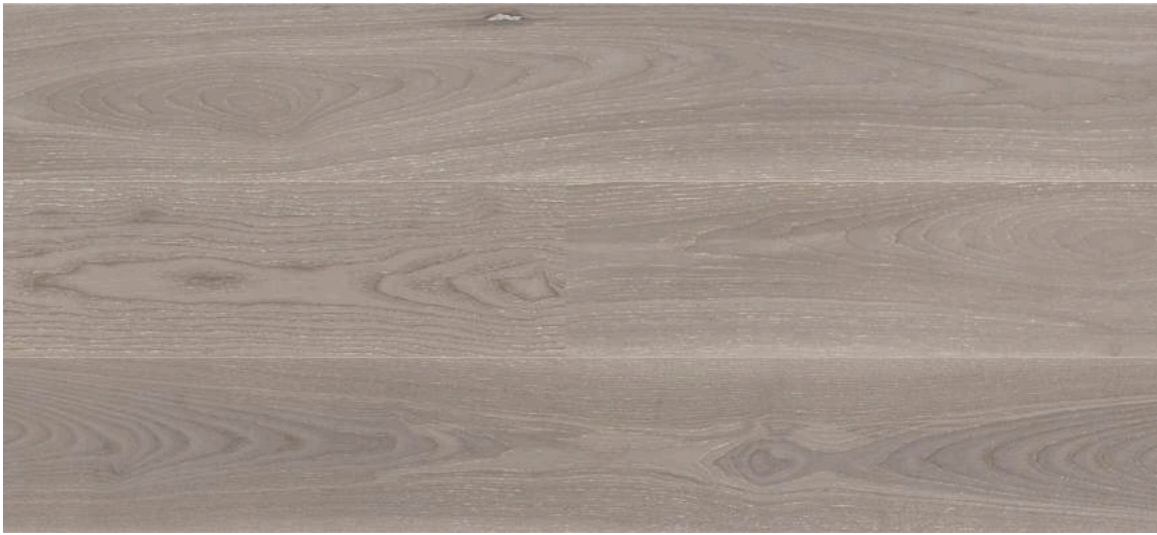
1 Strip Ash Elegant Dune White Pores 2B Extra Matt Lac Gloss 5% #9034