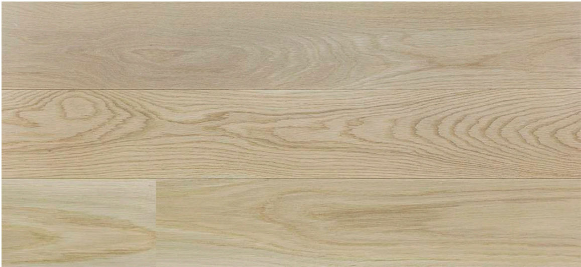
1 Strip Oak AB London 2B Extra Matt Lac Gloss 5% #4043