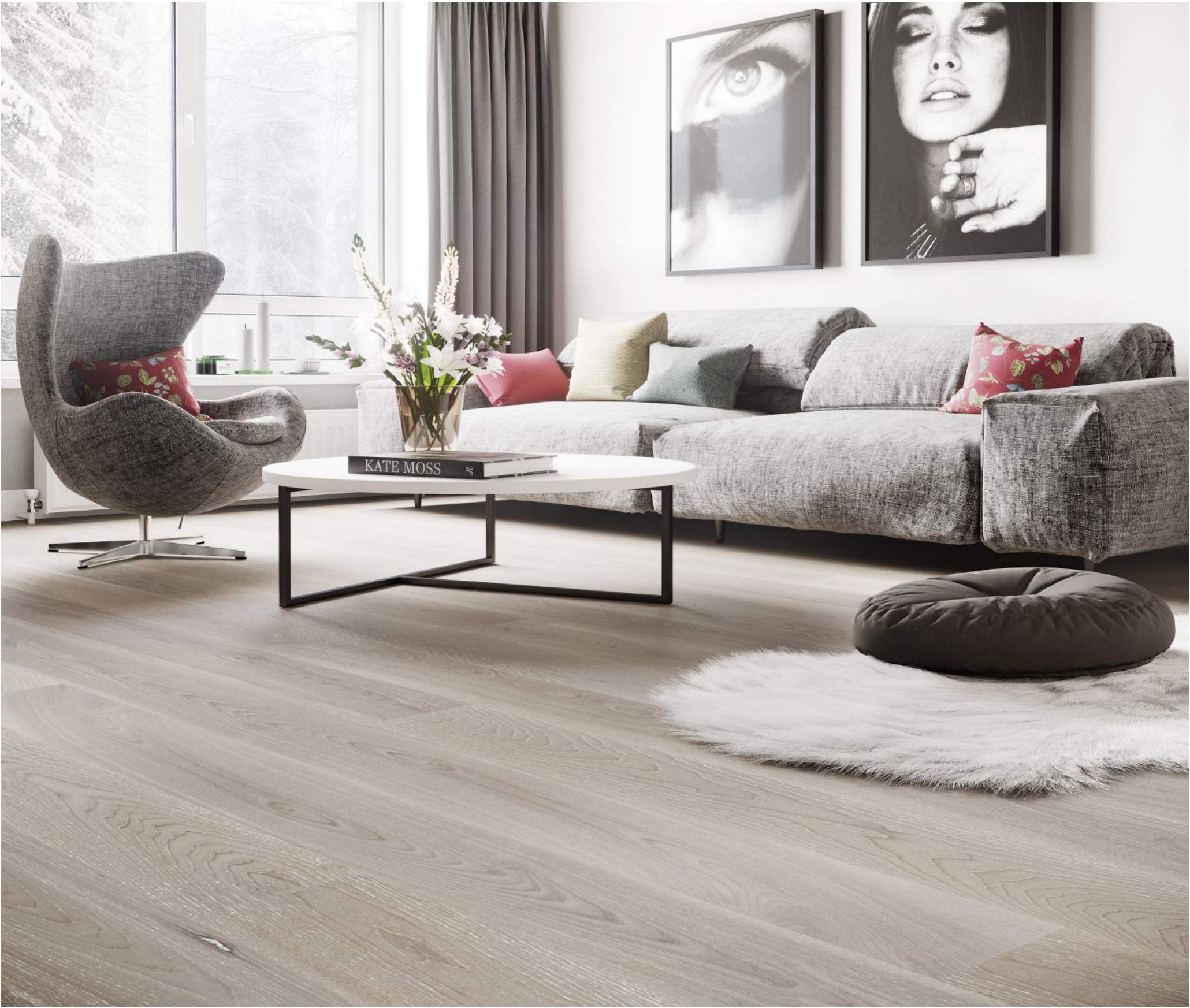
1 Strip Ash Elegant Dune White Pores 2B Extra Matt Lac Gloss 5% #9034