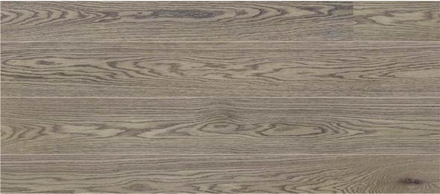
1 Strip US Oak Antique Reactive Stain 2B Pure Line # 5854

Different origin oak will behave differently when treated with reactive stain. The photos show difference between treated European vs. American White Oak.