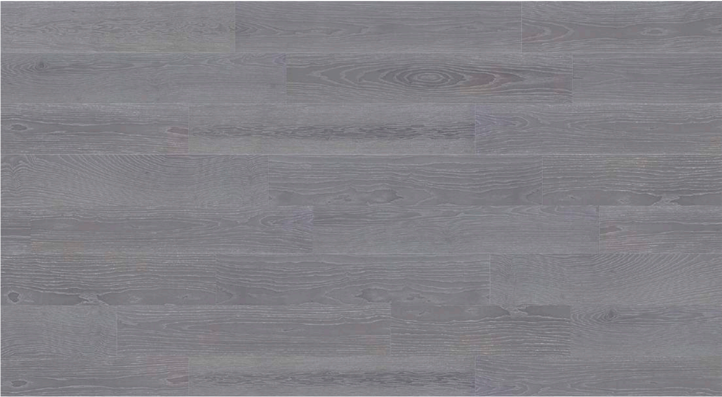
Size Options: 100 x 600 mm 100 x 700 mm 100 x 900 mm Shipdeck Pattern Ash Elegant Dune White Pores 4B