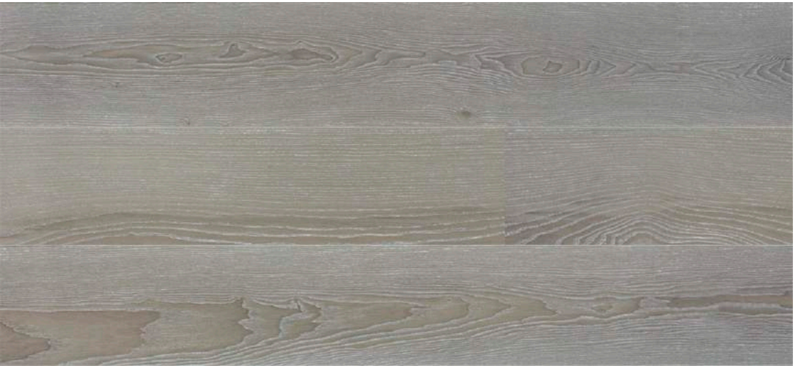
1 Strip Ash Elegant Olive Grey Ivory Pores 2B Extra Matt Lac Gloss 5% #9035