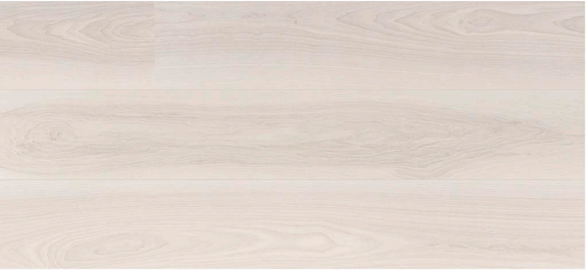
1 Strip Ash Elegant Frost Ivory Pores 2B Extra Matt Lac Gloss 5% #9040