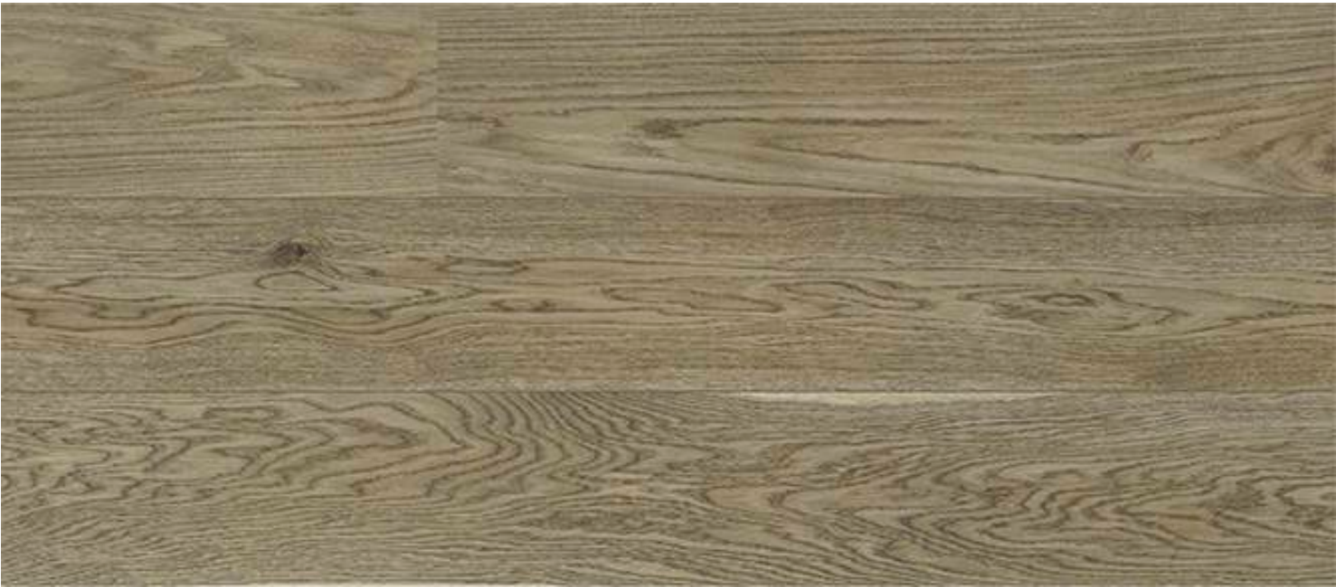
1 Strip EU Oak 240 mm Wide Antique Reactive Stain 2B Pure Line #5461