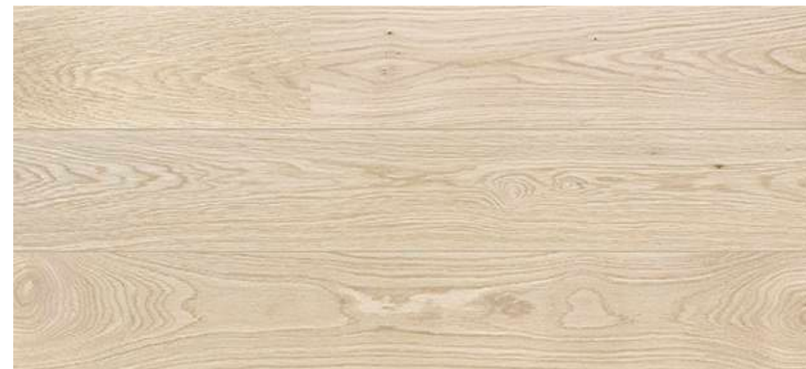
1 Strip 160 mm Wide US Oak AB Brush 2B Pure Line #5828