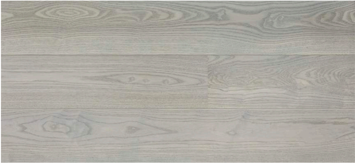
1 Strip Ash Elegant Stone Grey 2B Extra Matt Lac Gloss 5% #3250