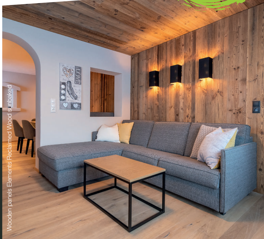
Wooden panels Elements Reclaimed Wood sunbaked

Room concepts made of natural wood for floors, walls & ceilings