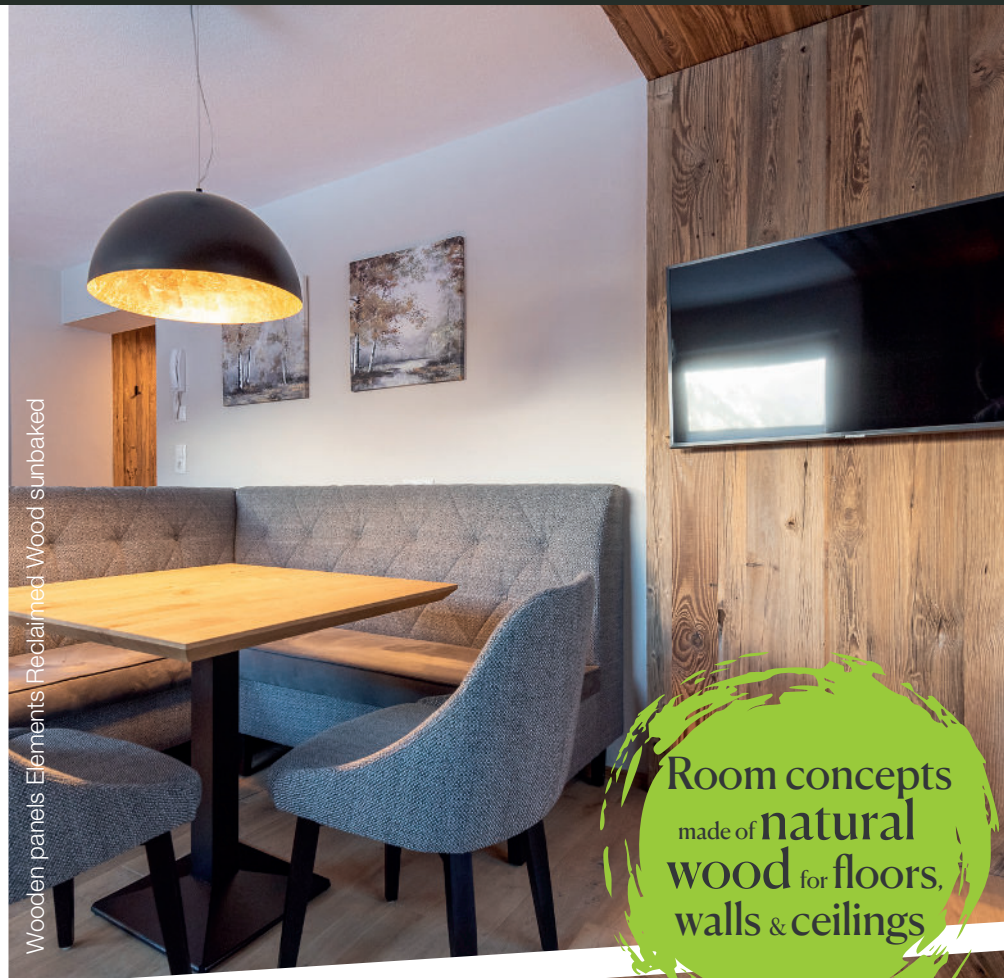
Wooden panels Elements Reclaimed Wood sunbaked

Room concepts made of natural wood for floors, walls & ceilings